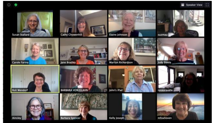
Participants: IBC Meeting