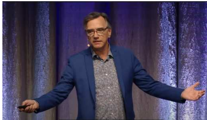
Bill Burnett, Designing Your Life: Build a Life that Works for You

"Living coherently doesn't mean everything is in perfect order all the time. It means you are living in alignment with your values and have not sacrificed your integrity along the way."