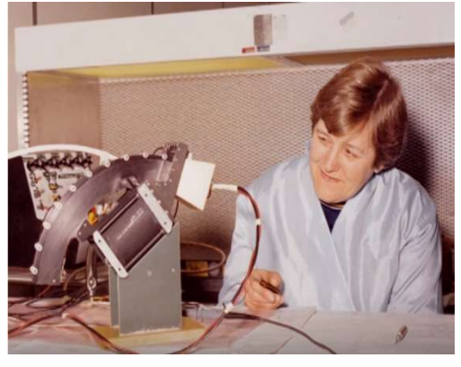
the "final frontiers" of space. <a href="https://www.nae.edu">www.nae.edu</a> www.ethu,org. (oral history) <a href="https://www.nationalmedal.org">www.www.nationalmedal.org</a>

a Masters Degree from USC. Douglas Aircraft hired her even though she did not have an engineering degree. She became one of the few women to work with rocket propellants